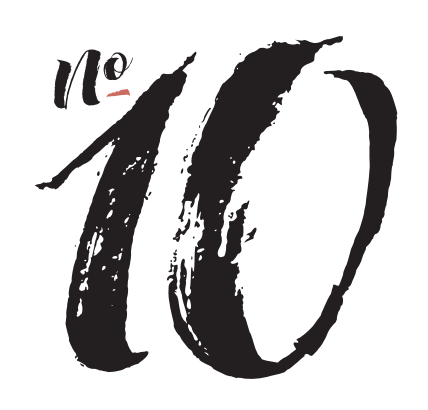
BAR & RESTAURANT EST. 1986