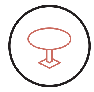
Do not move furniture – these have been positioned for social distancing measures